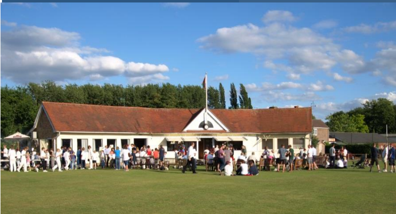
End of season BBQ