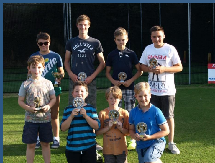
Some of the 2014 award winners