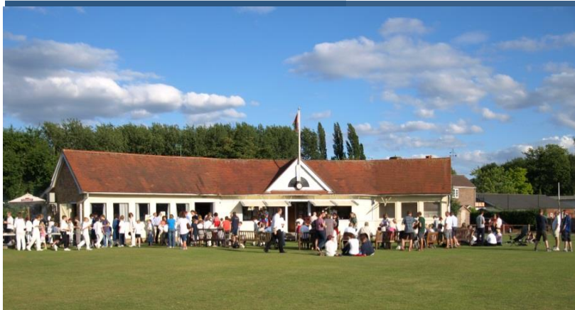
End of season BBQ